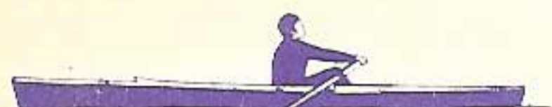
ALDEN OCEAN SHELL

Box 251 — Pepperrell Road Kittery Point, Maine 03905 Tel. 207-439-1507